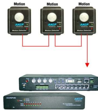
This demonstrates the connection of 3 motion detectors.

Status: If the sensor is offline the status is No Status. If the sensor is online and there is no motion detected, the status is Normal. If motion is detected then the status is Critical. If at any time communications with the Motion Detector are lost, the status of the Motion Detector is changed to sensorError.